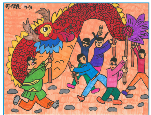
China - Dragon Dance

Art and descriptions can be found at the end of this lesson.