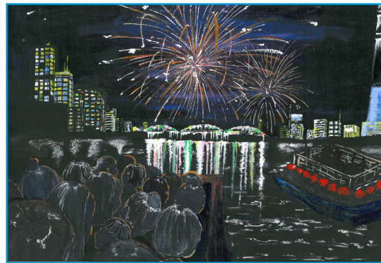
Japan - Yakatabune