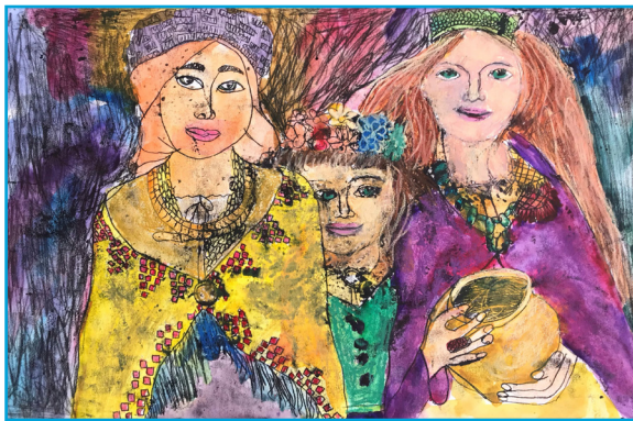
Latvia - The Song for the Sea