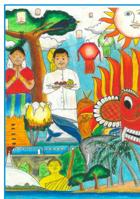
Sri Lanka - My Culture & Heritage