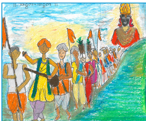
India - Palkhi Procession