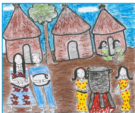
The Gambia - Naming Ceremony