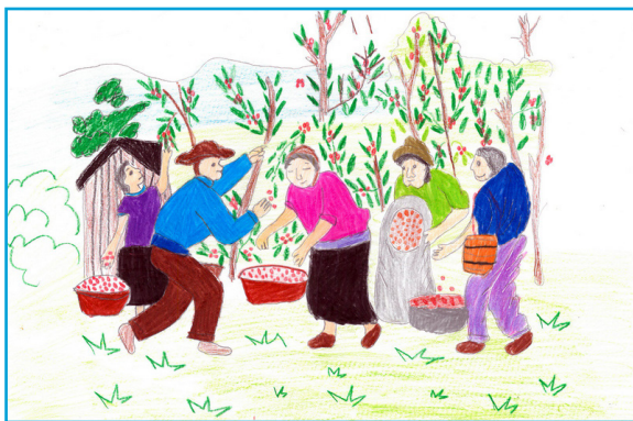
Guatemala - Harvesting Coffee