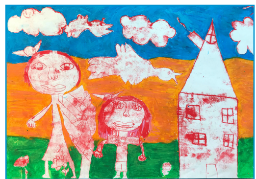
Cyprus - Swallows

Art and descriptions can be found at the end of this lesson.