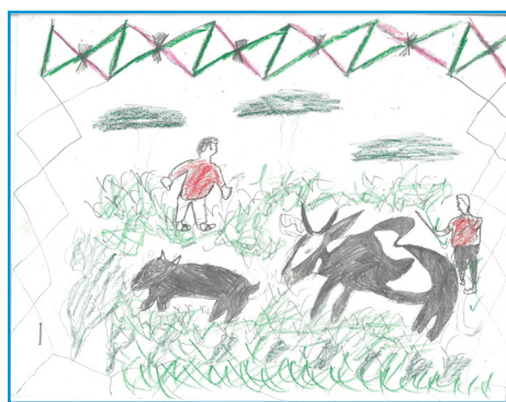
Kenya - Grazing