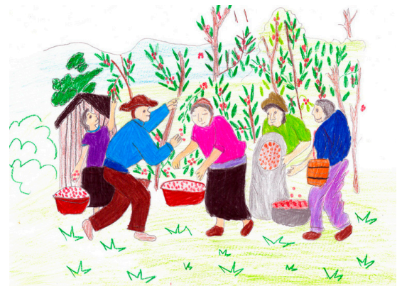
Harvesting Coffee, Karlyn, Guatemala

Illustrate your observations including any ideas for solutions that might help restore the balance of nature.