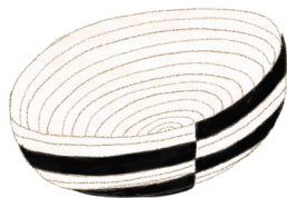
traditional agaseke (baskets)