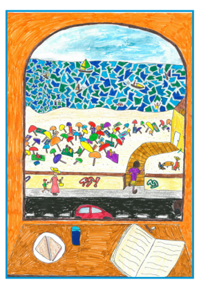
Spain - The View From My Window