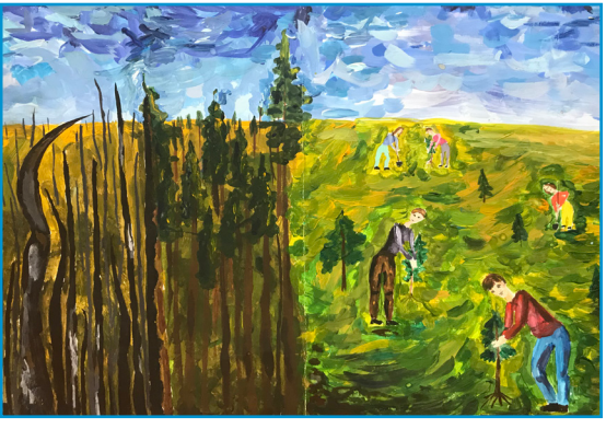
Russia - Keeping Forests