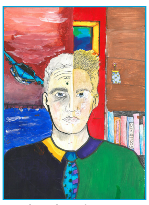
England - The Future