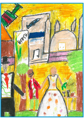
Turkey - Did You Pray for Saving Nature?